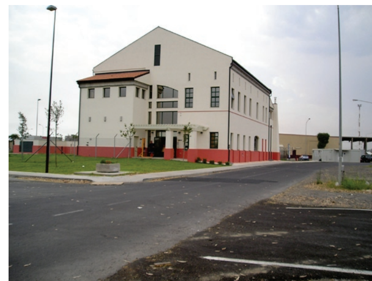
A new facility . . .