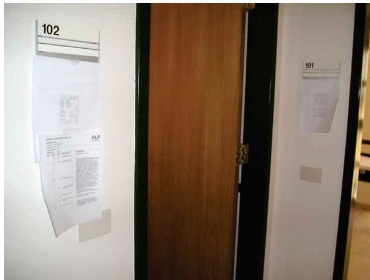
(BELOW) Detailed drawings and inventory lists are posted outside the door of each room to facilitate and expedite the installation process