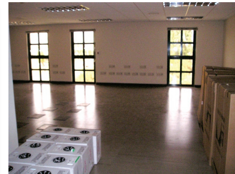
An empty space . . .