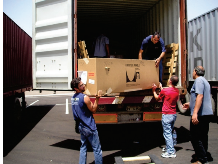
(BELOW) Nova's Installation Team unloads furniture boxes from the container trucks at the site