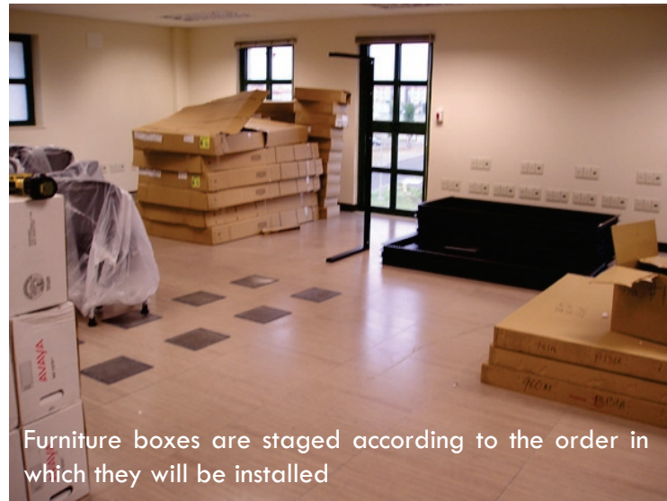
Furniture boxes are staged according to the order in which they will be installed