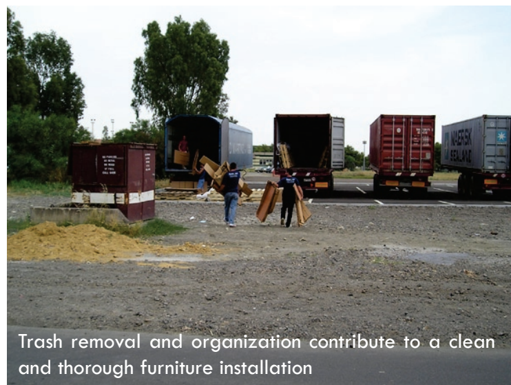
Trash removal and organization contribute to a clean and thorough furniture installation