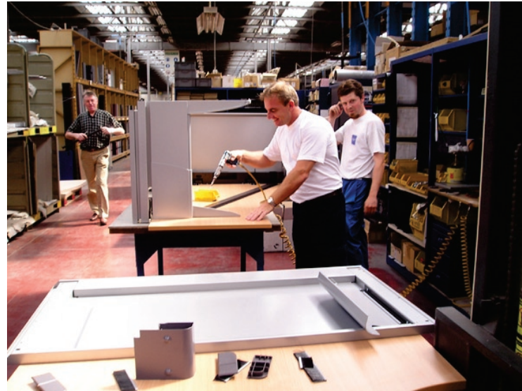
(LEFT) Nova's Furniture Technician visits a factory to learn installation techniques unique to this type of modular furniture